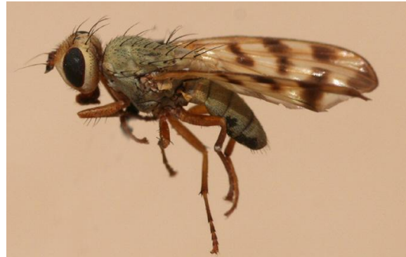
Figure 1. Ceroxys latiusculus , a type of picture-winged fly.

What attracts attention is that this species frequently enters buildings in autumn as it searches for sites to survive winter. Along with cluster flies ( Pollenia species), this picture-winged fly is the most common fly found indoors during at this time of year.